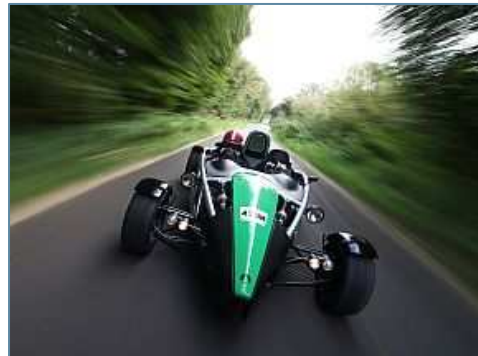
The Ariel Atom 3: made in Somerset

With some of the best broadband connectivity and take-up rates in the UK, being in Somerset means your company can harness the power of the internet to boost sales and stay in touch. The creative sector, including web design and associated IT support, are amongst the highest growth sectors of industry in Somerset... More details