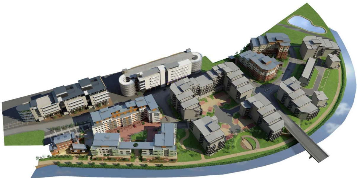
FIREPOOL LOCK MASTERPLAN AS AT 2012