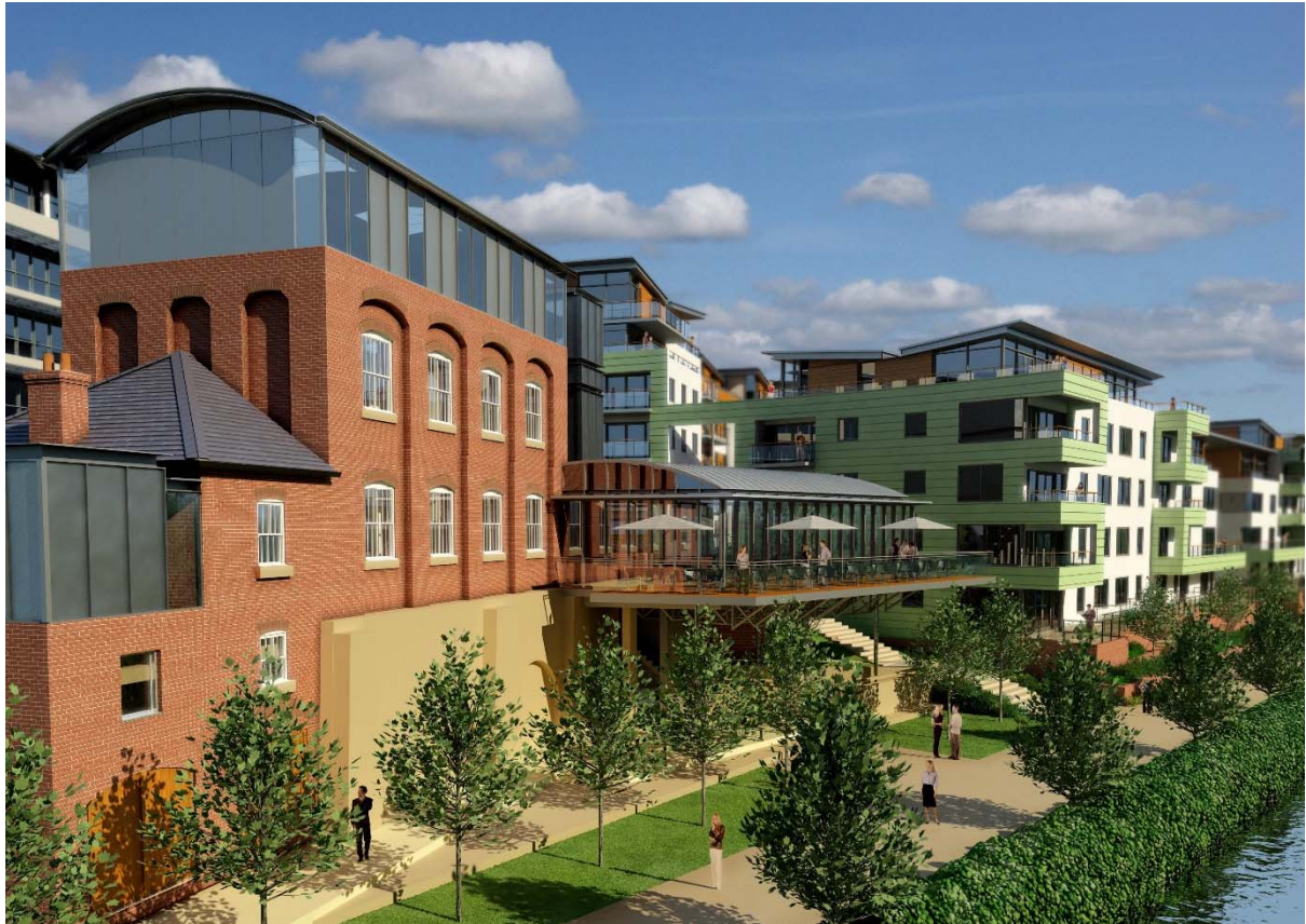
PUMP HOUSE CGI